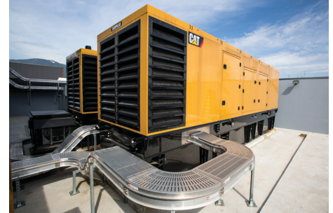
Two Cat C32 diesel generator sets provide backup power for the data center building and the infrastructure to support 50 high-density server racks.